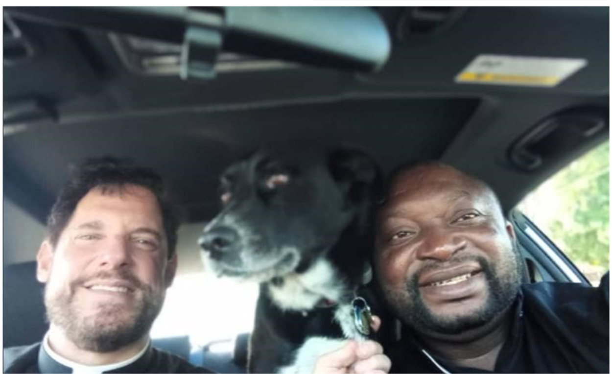
Dear Humans, Not only have I made a new friend, I've become an international sensation. People's Republic of the Congo, here I come! WOOF!