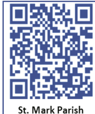
St. Mark Parish