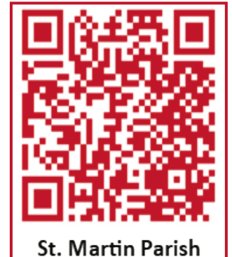
St. Martin Parish