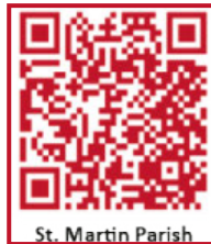
St. Martin Parish

Or with your smartphone scan this QR code.