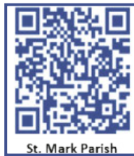
St. Mark Parish

For St. Mark Parish go to: osvhub.com/stmarkstl/giving/funds Or with your smartphone scan this QR code.